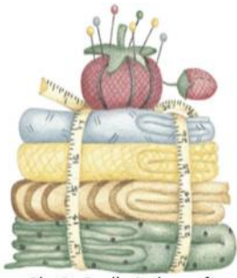
The St. Paul's Quilters of United Fellowship Lutheran Church

August and September were busy months for the quilters: